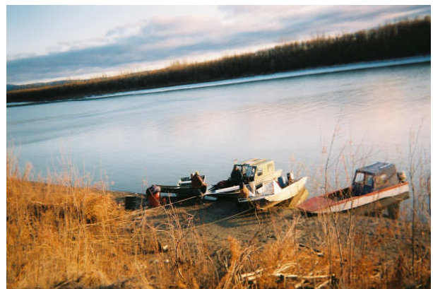
On the bank of the Yukon River at Stevens Village – Fall 2008.