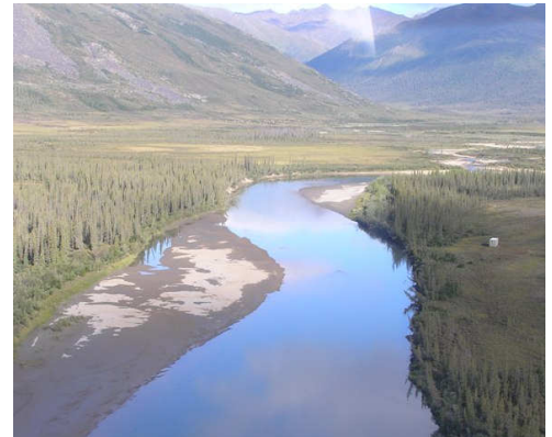
The Chandalar River before it flows into Chandalar Lake

The team was also called out to participate in a series of two exercises & one drill during August with Pump Station 5 personnel on the Chandalar River where it flows into Chandalar Lake. This is a remote area of the Pipeline system that was accessed by helicopter through the Brooks Range. It was a great opportunity for the team to put into practice boom deployment and to assemble helicopter sling loads in getting the equipment to the Chandalar, and those who participated will bring their experience back to the team's regular quarterly trainings at Pump Station 6. Team members included Jamey Joseph, Henry Smoke, Gary Smoke, Simon Matthew, Maureen Mayo, Merrill Moses, Elizabeth Smoke, Jennie Ortiz, and David Joseph.