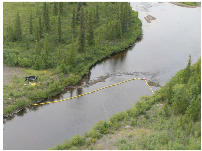
Aerial view of "boom" sections laid out across the Kanuti River which is done to direct & contain oil spilled in waterways. There are pumps & skimmers set up to pick up the oil and deposit it into portable tanks at each boom set-up. Photos taken by Alyeska personnel at the August 2009 Drill.