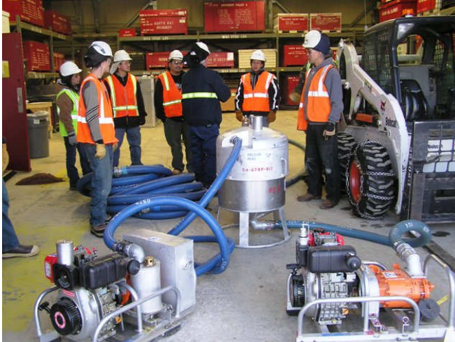
The Oil Spill Team getting an over view of the Vikoma Vacuum System

The Oil Spill team went out on their quarterly training on November 13 – 17, 2008. The training centered on a variety of containment and recovery operations and equipment used at an oil spill. An overview was given on the Vikoma Vacuum Skimmer, a portable retrieval system used to pick up oil on water or land. The team took out and drove the Tucker, a vehicle commonly used in transporting people and equipment in the winter months. A “decon” area was set up which is used for the clean-up of crude oil on personnel and equipment, and some team members got fully out-fitted in protective outerwear as if at an actual oil spill. The quarterly trainings offer continual practice that keeps the team up-to-date and qualified to respond effectively in case of an emergency. The foremen were John Mayo and Pete Hjelm.